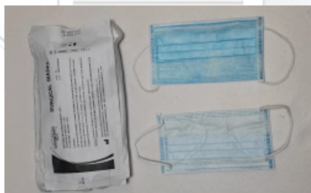
Photo of Samples